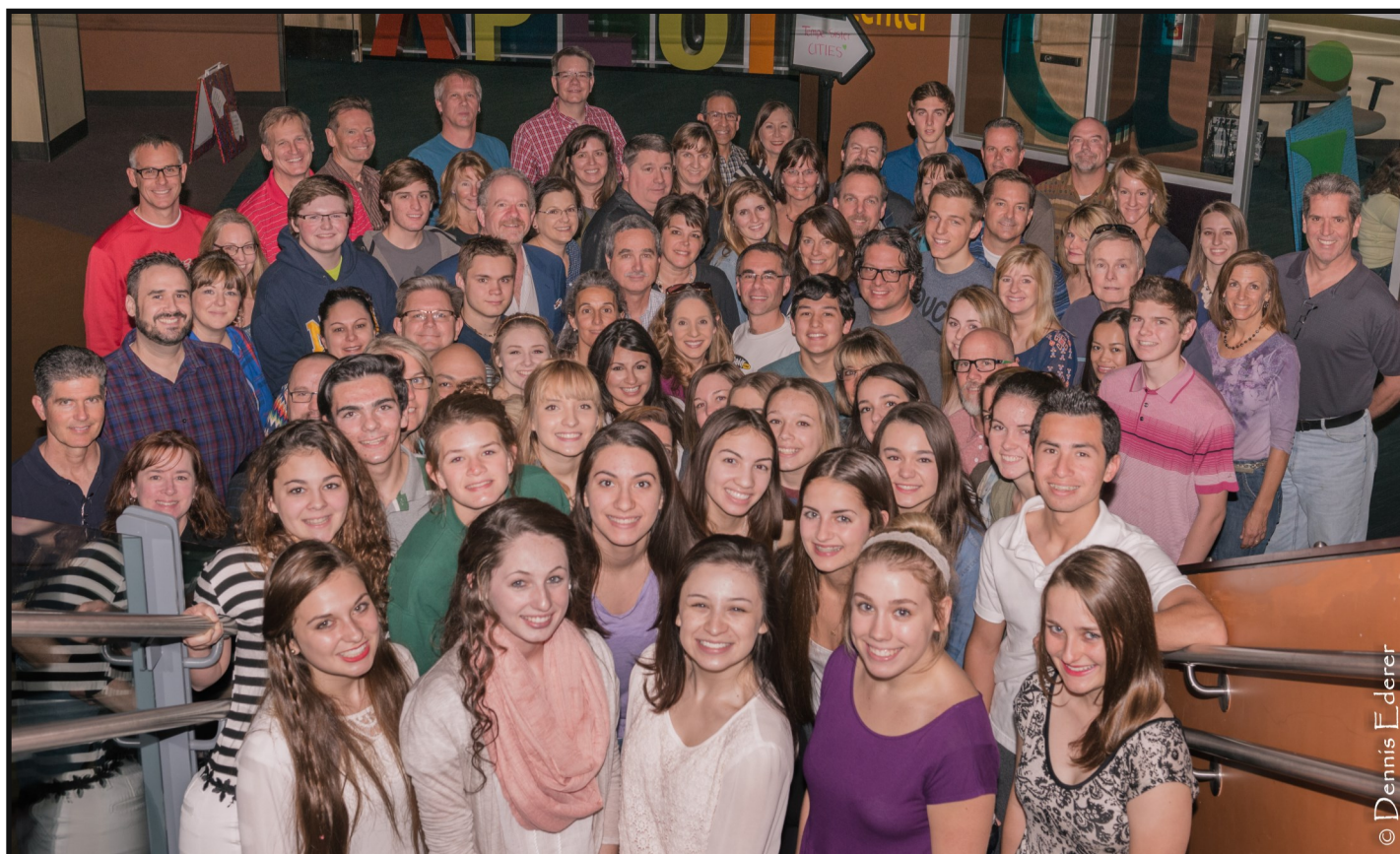
On March 1, 2015 the brand new 2015 Student Ambassadors and their parents gathered for their orientation meeting to kick off their Student Exchange adventures!